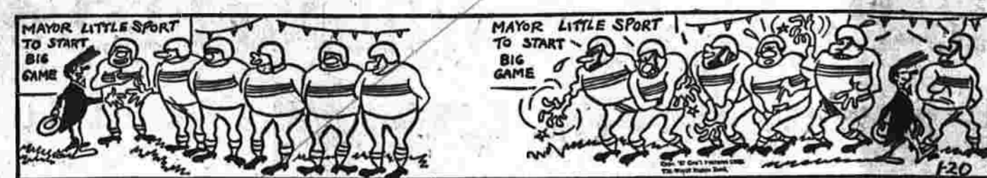
MAJOR LITTLE SPORT TO START