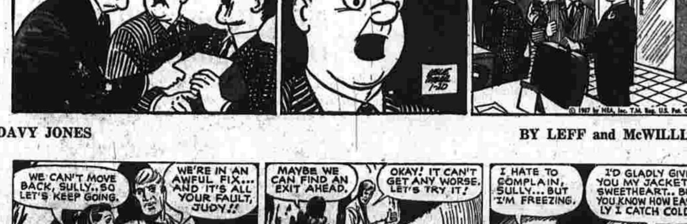
BY LEFF and McWILLIAMS