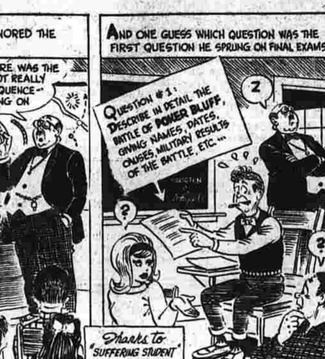
THERE OUGHTA BE A LAW