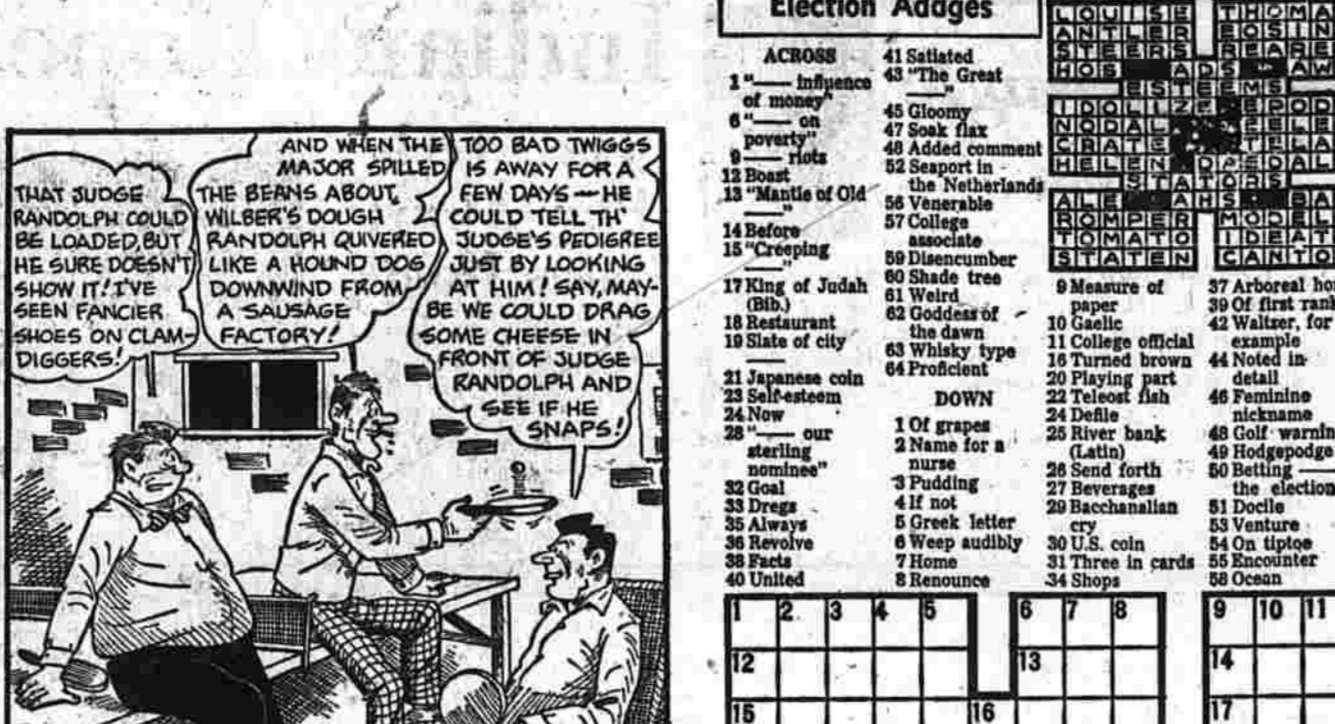
BY ROUSONOUR BOARDING HOUSE with MAJOR HOOPLE