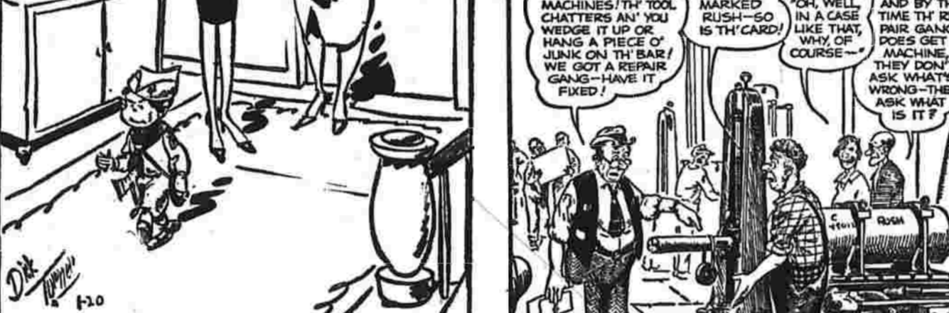
BY WALT WETTERBERG