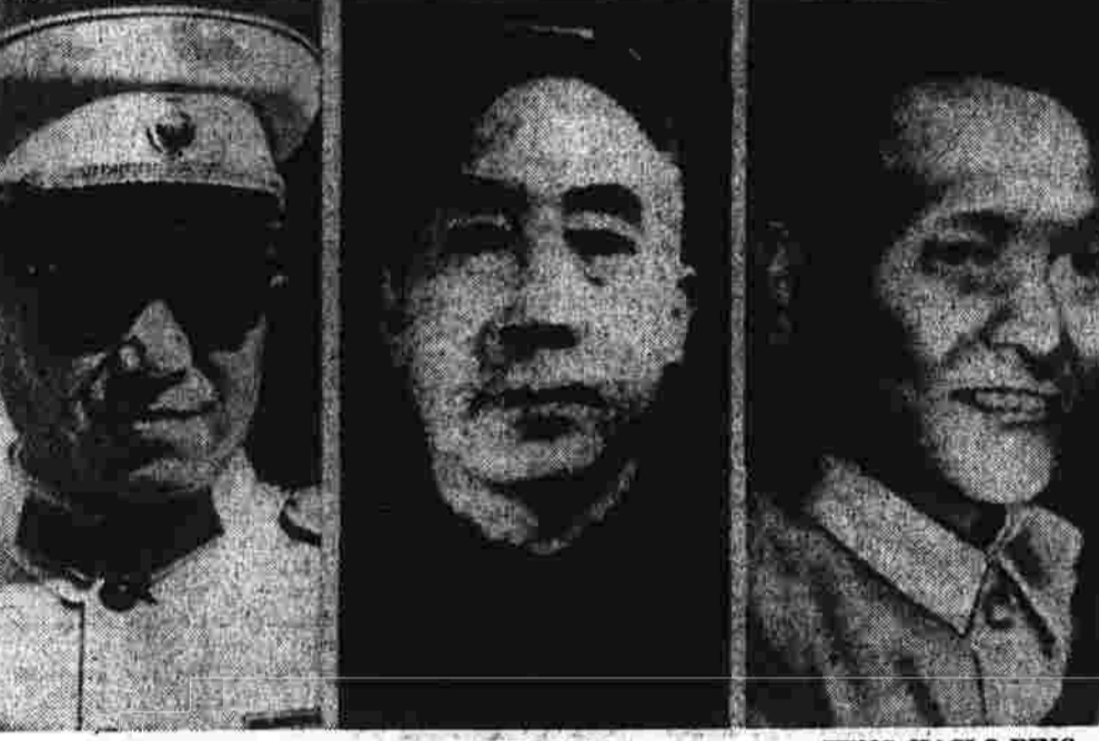
LO JUI-CHING PO I-FU TENG HASLO-PING

WASHINGTON (AP) — A long-playing record entitled "Keep the Faith, Baby" is going to be one of Rep. Adam Clayton Powell's major weapons in his fight for his House seat.